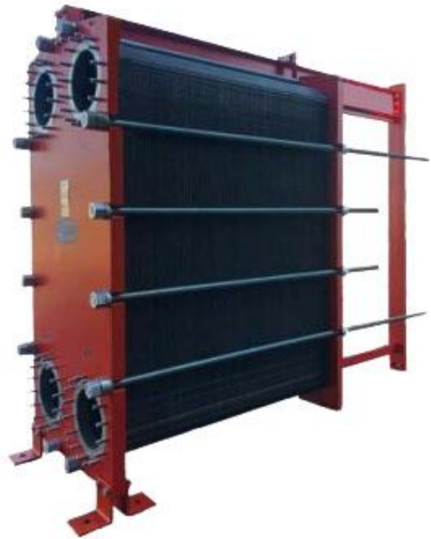
HG II SERIES Plate Heat Exchanger